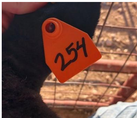
Flock Tag – matches registration papers

It is unlawful to remove USDA scrapie tags. DO NOT REMOVE SCRAPIE TAGS! The committee should not remove tags.