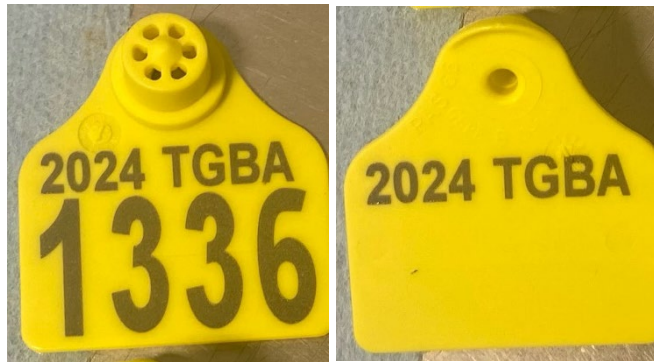
Tag colors change every year.