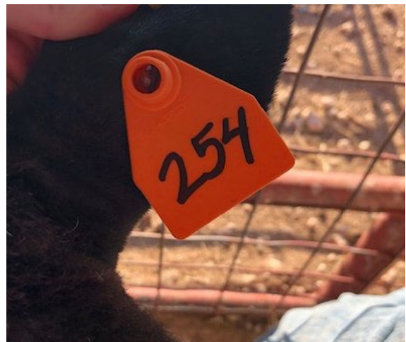
Flock Tag – matches registration papers

It is unlawful to remove USDA scrapie tags. DO NOT REMOVE SCRAPIE TAGS! The committee should not remove tags.