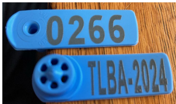
Tag colors change every year.