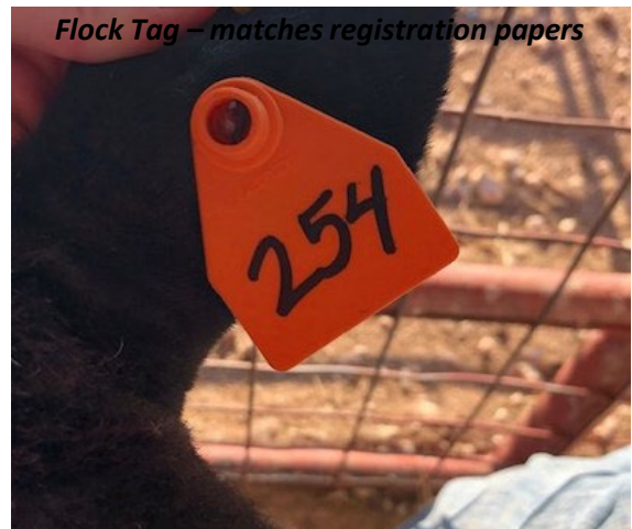
Flock Tag – matches registration papers

It is unlawful to remove USDA scrapie tags. DO NOT REMOVE SCRAPIE TAGS! The committee should not remove tags.