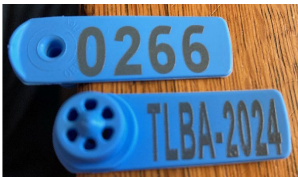
Tag colors change every year.