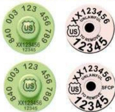
Scrapie 840 RFID Ear Tags: