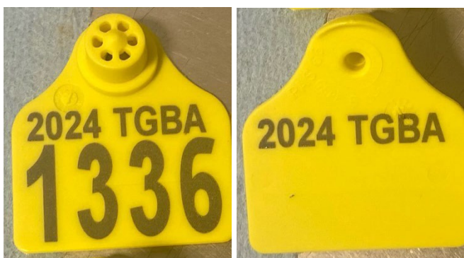
Tag colors change every year.